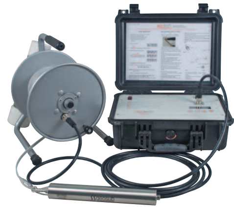
SS Geosub with Geotech AC Controller