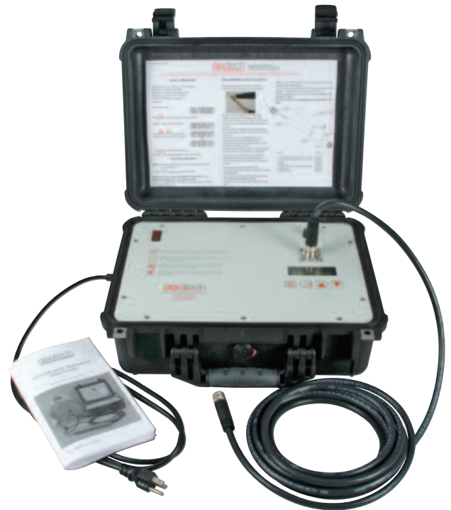
Geotech AC Controller