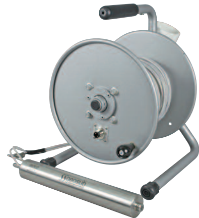
SS Geosub with Geo Reel