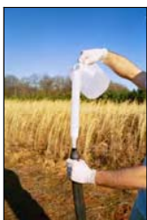
Fill with Deionised Water