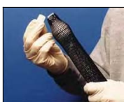
Insert the Plug