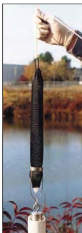
Ready for Deployment

(Leave for 2 weeks or until next sampling event)