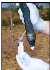
Sampling for VOC

(Leave for 2 weeks or until next sampling event)