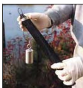
Attach the Weight